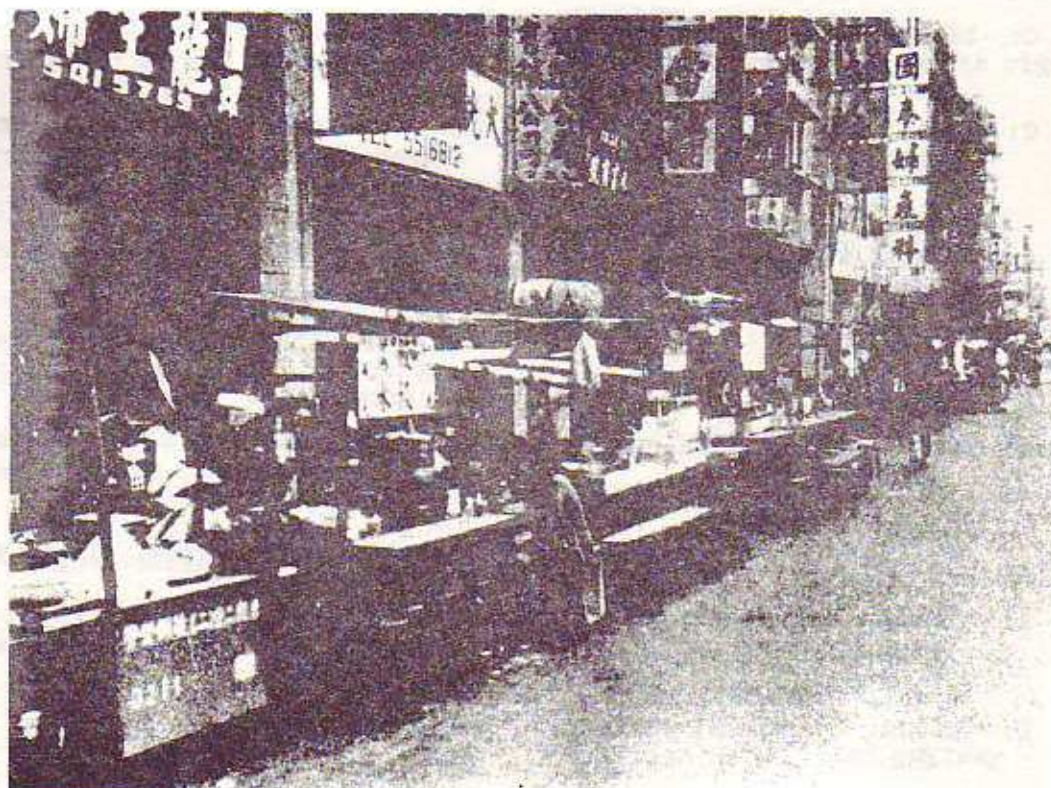
Snack stands in Taipei